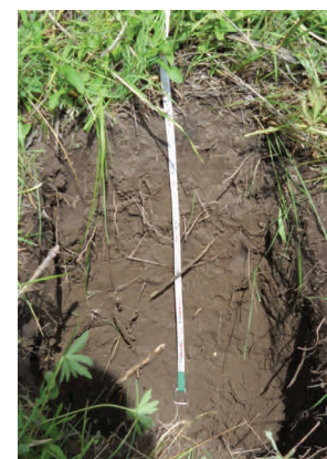
Figure 3. Mountain Loam Ecological Site