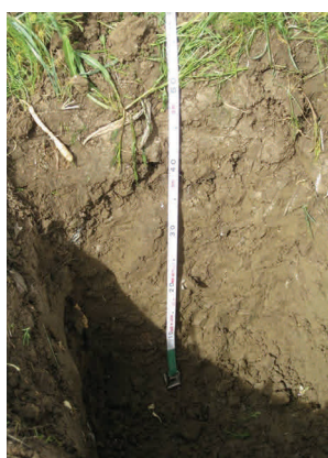
Figure 2. Claypan Ecological Site

ecological site and how other site characteristics, such as hydrology and soil stability, might change with them. STMs describe the environmental conditions, disturbances and management actions that cause vegetation to change from one group of plant species to a different set of species, and the management actions needed to restore plant communities to a desired composition. STMs help you identify where your land is currently (its present state), suggest potential alternative states, and provide ideas about how to move to a more desirable state and avoid unwanted transitions.