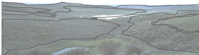
Figure 5. Rangeland Depicting Different Types of Land Based on Visual Clues in Aspect, Topography and Vegetation.