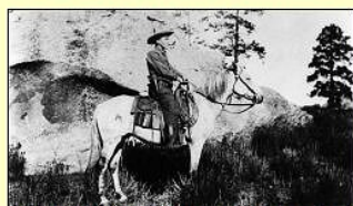
Aldo Leopold on "Polly," range riding the Carson National Forest in 1912.

Aldo Leopold spent much of his early career with the US Forest Service assessing range conditions, managing grazing allotments, addressing erosion, and developing nascent game and wildlife management policies. These formative experiences contributed to his later insights into sustainable resource management and an enduring land ethic (Meine 1988).