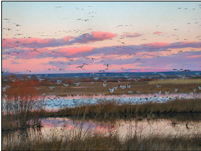
Snow Geese at the Bosque del Apache National Wildlife Refuge, New Mexico.

The Board will hold its summer meeting at the SRM headquarters. The first 2 days will be to interview candidates for the Executive Vice President position followed by the regular Board meeting.