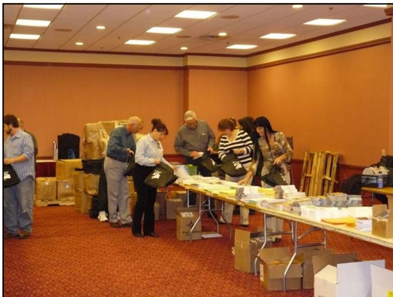
Stuffing bags for the Louisville Annual Meeting.

Have some pictures you'd like to share? Send them to us and we'll see about using them. Submit articles for the newsletter and include photos!