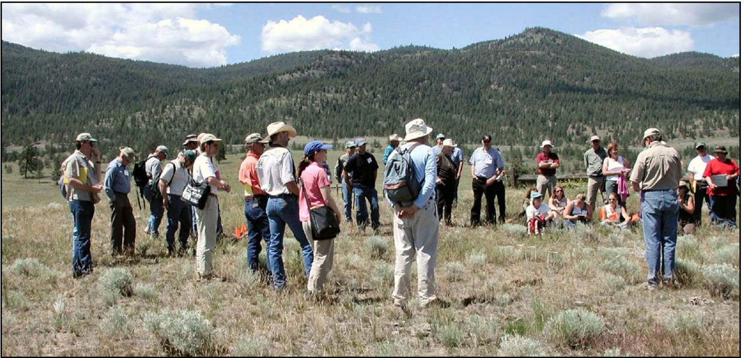
Pacific Northwest Section field tour (2004) near Merritt, British Columbia.