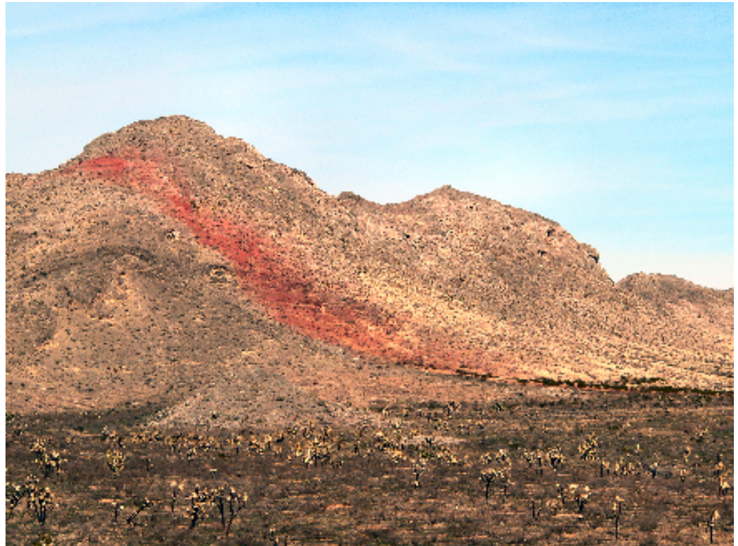
Fire retardant near Overton, Nevada.

Wildfires and related impacts, including invasive species, are causing huge ecological problems in all four of North America's large deserts including the Great Basin (and Colorado Plateau), the Mojave, the Sonoran and the Chihuahuan Deserts. The purpose of the American Deserts symposium is to link scientists and managers from all US deserts to explore opportunities to address wildfires and associated invasive species in a broad forum. The intent is to draw upon symposium participants to devise strategies and identify gaps in knowledge to reduce the